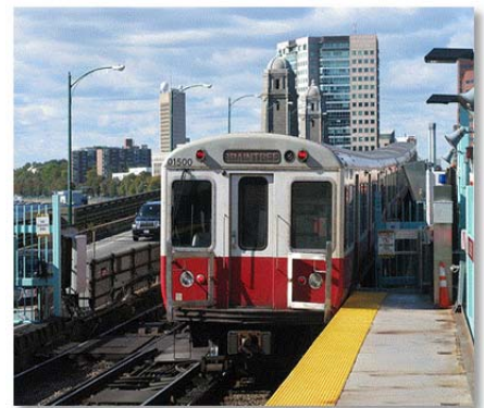
Red Line subway train crossing over the Longfellow Bridge, Cambridge to Boston